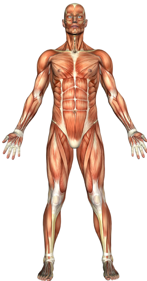
Front of body