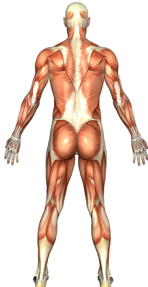
Rear of body